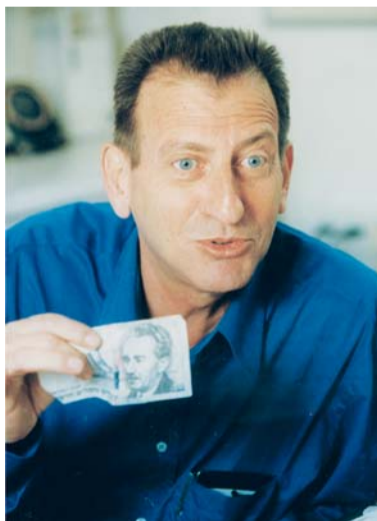
Does Mayor Ron Huldai lack the understanding and genuine will to provide affordable housing solutions?