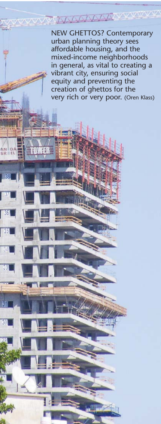
NEW GHETTOS? Contemporary urban planning theory sees affordable housing, and the mixed-income neighborhoods in general, as vital to creating a vibrant city, ensuring social equity and preventing the creation of ghettos for the very rich or very poor. (Oren Klass)

state is NIS 500-700 in rental assistance.